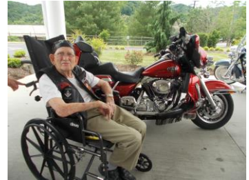
Fathers Day Poker Run