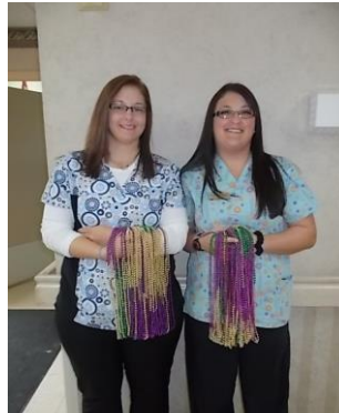
Mardi Gras '16