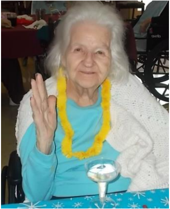
New Years at Noon! Mothers Day Tea