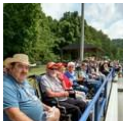
Kingsport Mets baseball