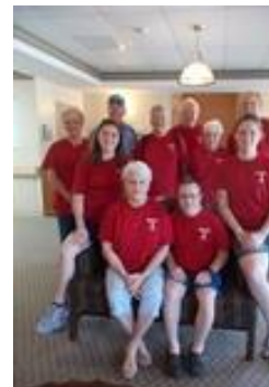
15 Year Celebration !