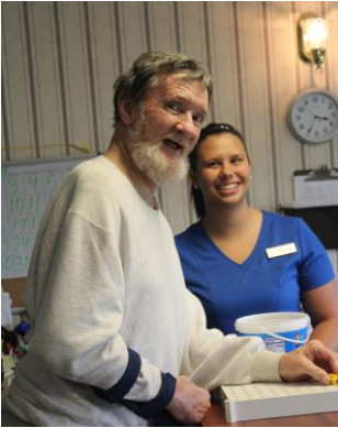
National Nursing Home Week