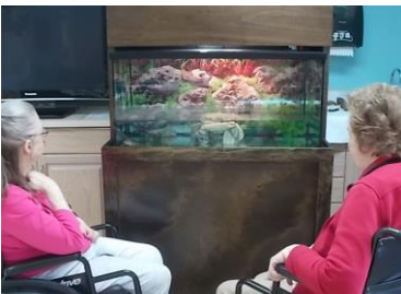
Tuck and Raphael got a new habitat!