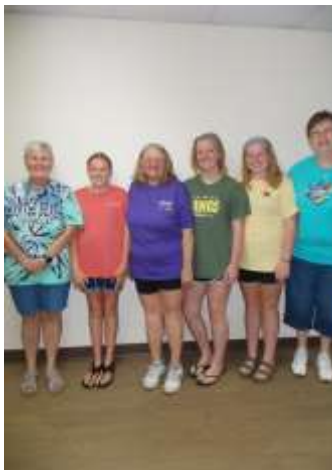
VBS Mission Team from Troutville Baptist Church