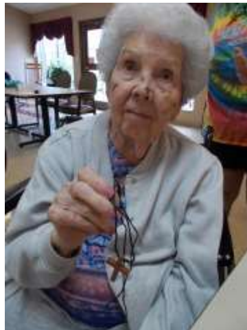
Troutville Baptist Church Troutville, Virginia