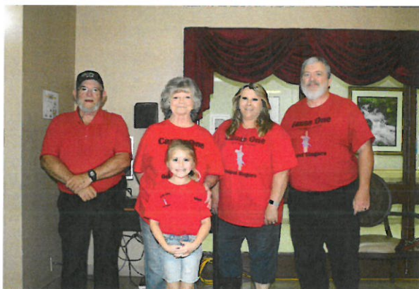
Cause One Gospel Singers