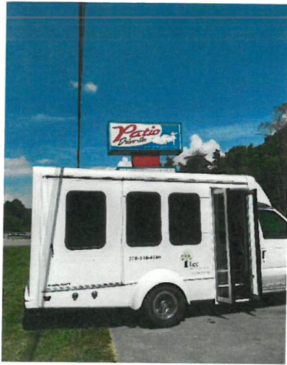
NATIONAL soft serve ice cream day