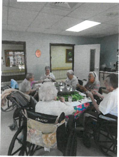
Beans & Corn