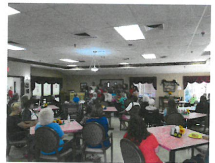
Family Night Calvary Baptist Church Youth Choir